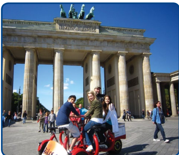
Trip to Berlin