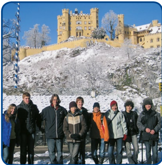
Trip to Neuschwanstein