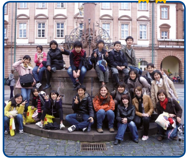
Trip to Heidelberg