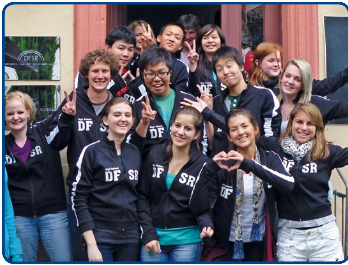
Students in front of the DFSR building