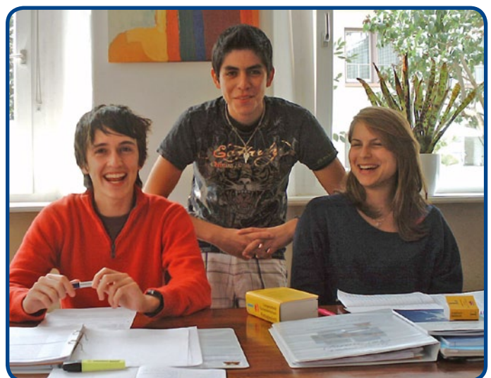
Students during the language & orientation course