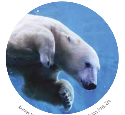
Journey to Churchill exhibit at the Assiniboine Park Zoo