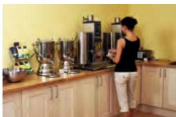
Berlin | Breakfast room in the residence