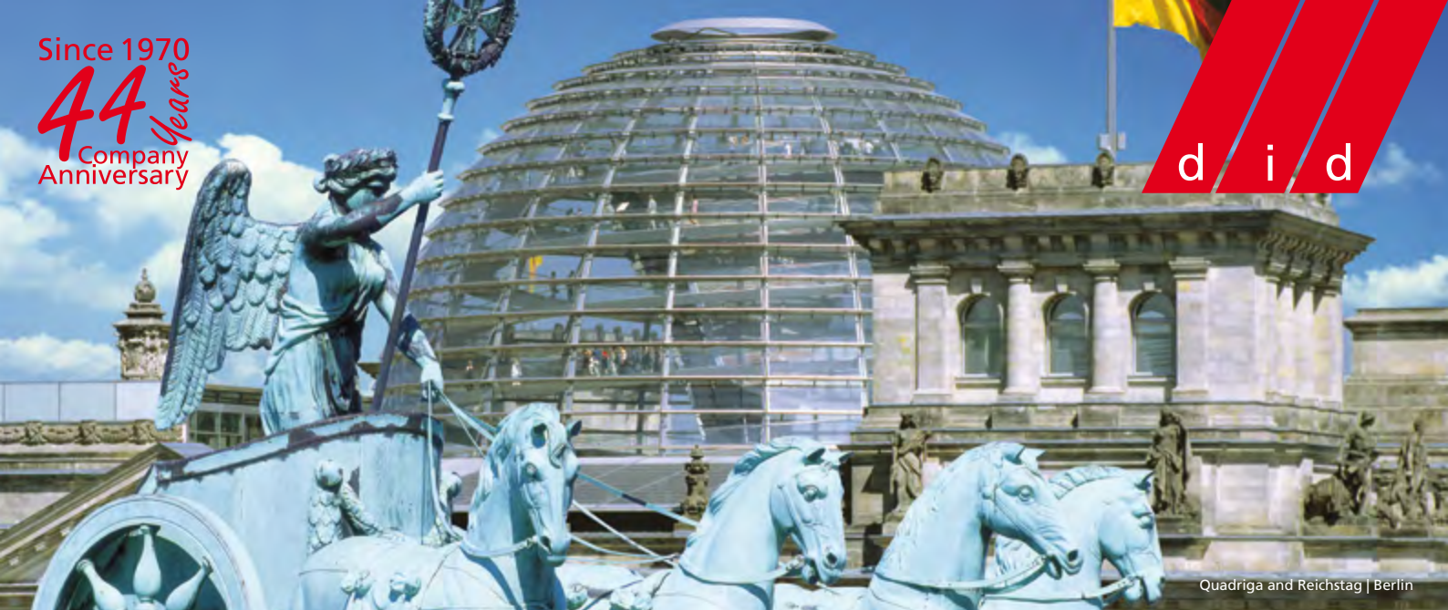
Quadriga and Reichstag | Berlin