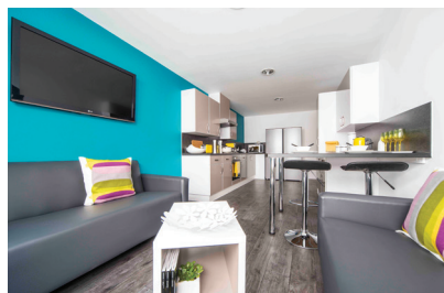
Shared kitchen/living area