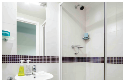
En-suite shower room